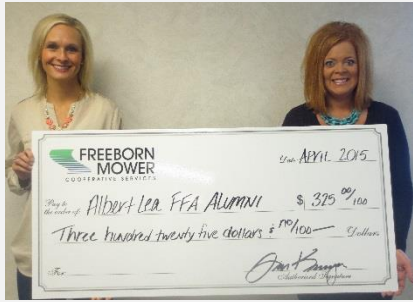
Albert Lea FFA Alumni