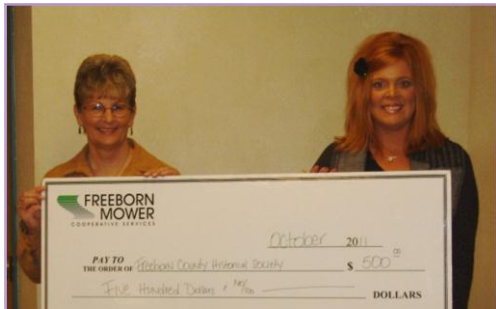
Freeborn County Historical Society