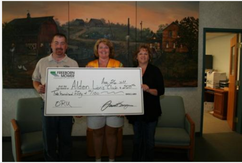
Alden Lions Club

Your Small Change Makes A BIG DIFFERENCE!