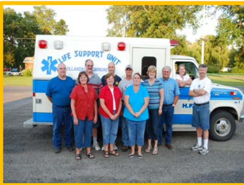
Hollandale First Responders