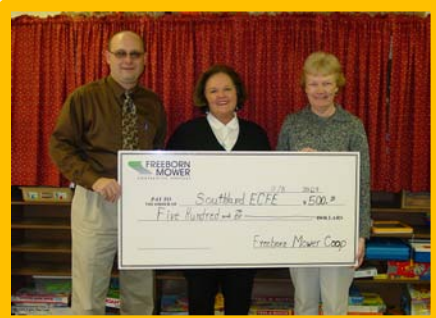
Southland Early Childhood Family Education