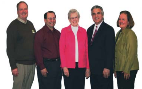
Your Operation Round Up® Board of Trustees