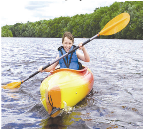
Albert Lea Community Education