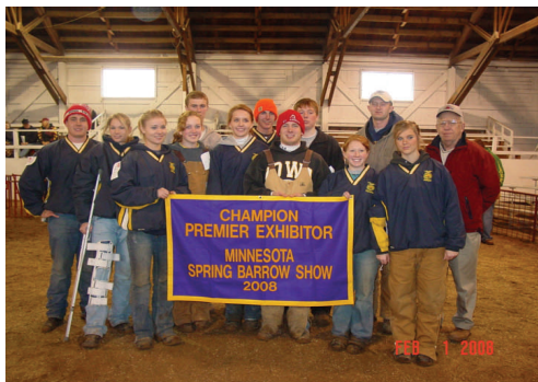
Minnesota Spring Barrow Show