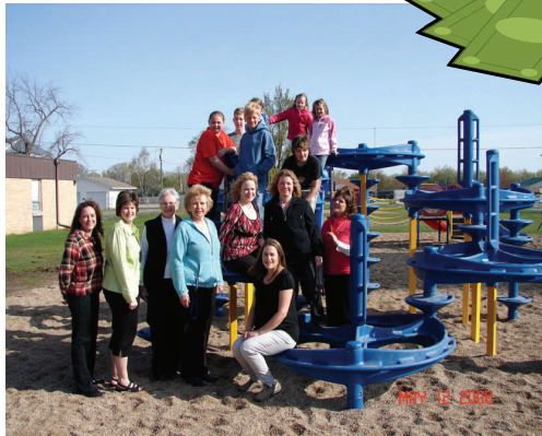
Glenville-Emmons Playground Equipment